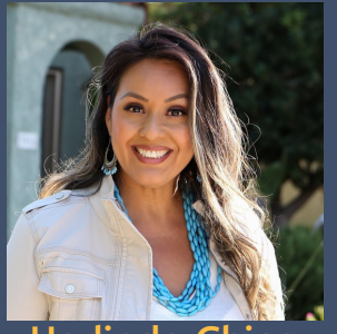
Herlinda Chico Long Beach City Council District 4