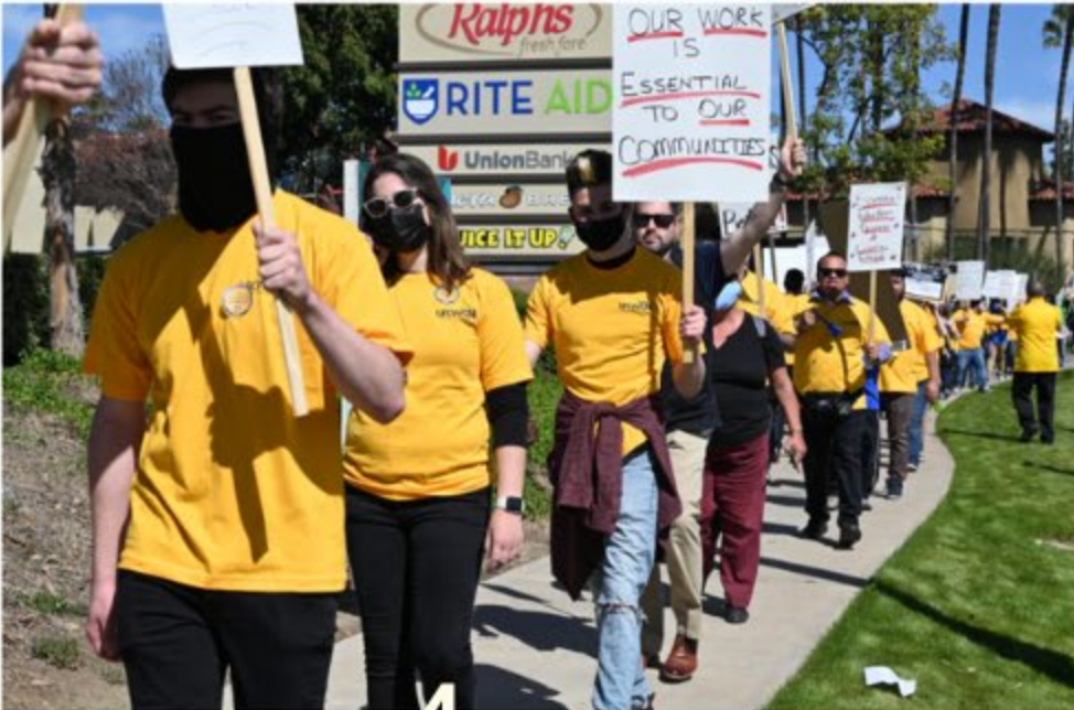
Grocery workers pack the sidewalk near a Tustin Ralphs on Monday, Feb. 28, 2022.