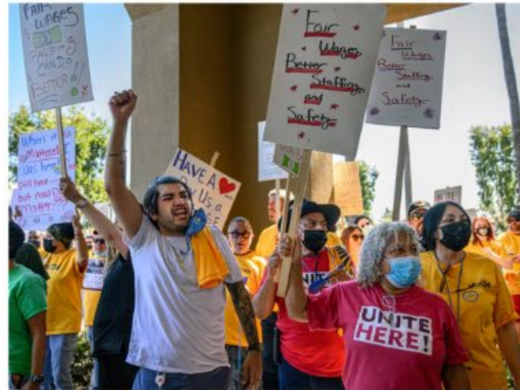
About 200 union workers staged a protest along the street and in front of a Ralphs supermarket in Tustin on Monday, February 28, 2022. Security guards were on hand to help customers through the crowd of protesters at the otherwise peaceful event.

The contract for 60,000 under UFCW is set to expire Sunday, March 6.